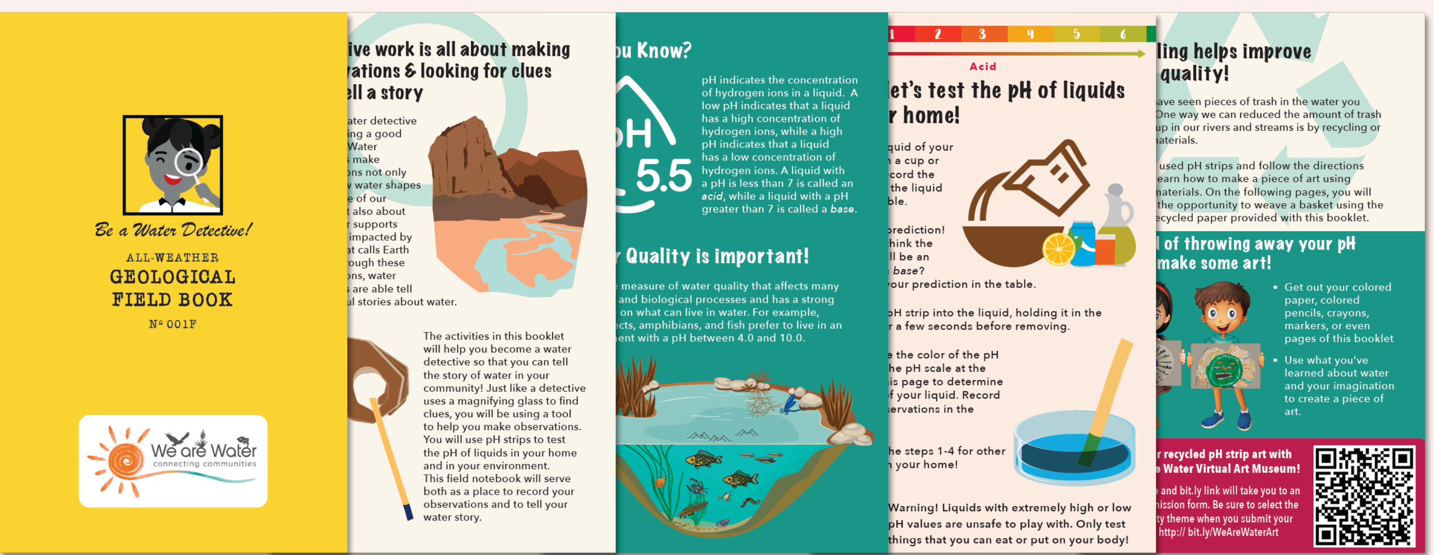
Be a Water Detective Take & Make Kit

Patty Montaño: patricia.montano@colorado.edu